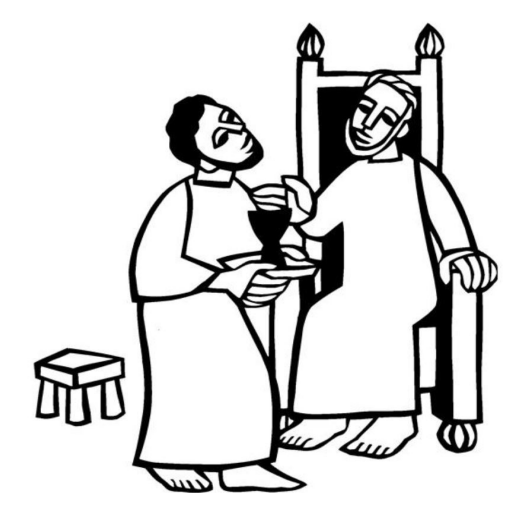
October 17, 2021

St. Luke Evangelical Lutheran Church 2695 Luther Drive | Chambersburg, Pennsylvania | 17202 https://stlukechambersburg.org