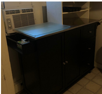
ISLAND FOR ST. SERAPHIM

Thank you for your hearts of generosity for these three appeals. Pentecost, and our Pentecost projects, continue through the end of November.