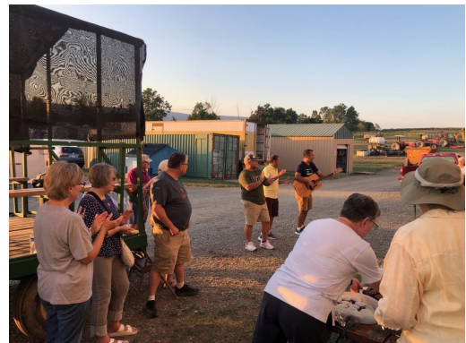
LADY MOON FARM / FFCM