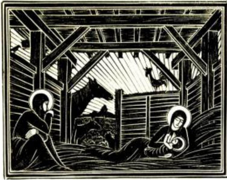
"Dawn," by Eric Gill, 1929

A Service of Lessons and Carols HOLY COMMUNION