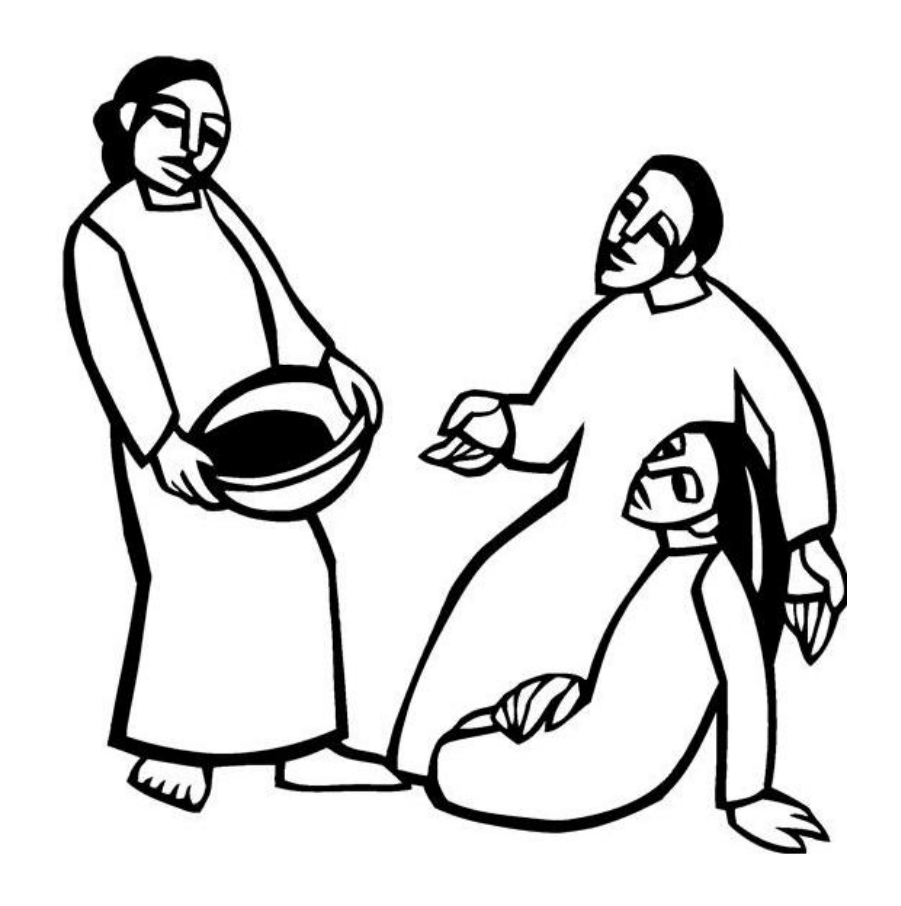
St. Luke Evangelical Lutheran Church 2695 Luther Drive | Chambersburg, Pennsylvania | 17202